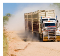
Heavy Duty / Commercial