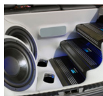
Car Audio Accessories